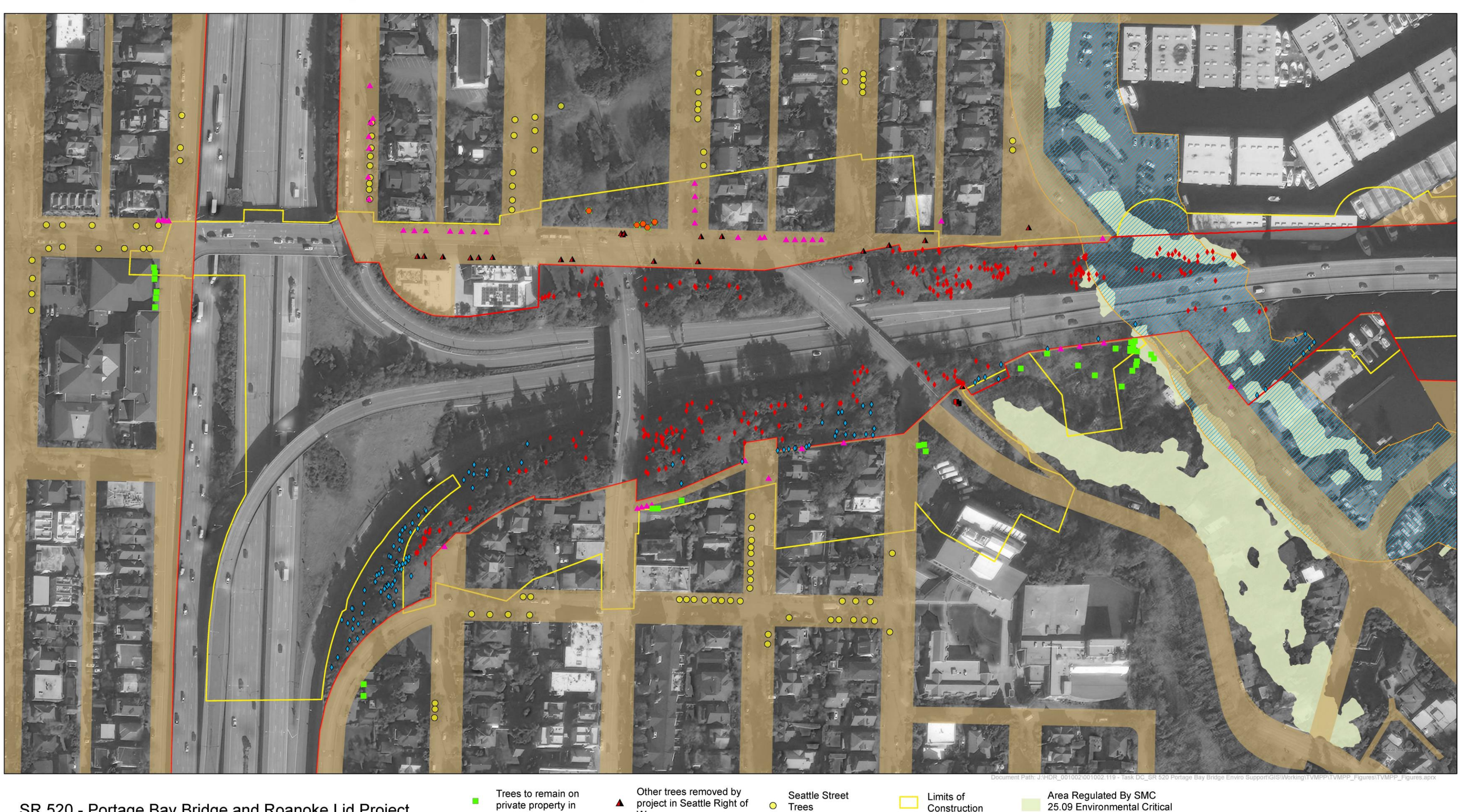
Exhibit A-2: I-5 Interchange, Roanoke, and Boyer Area Map

SR 520 - Portage Bay Bridge and Roanoke Lid Project Tree and Vegetation Management and Protection Plan